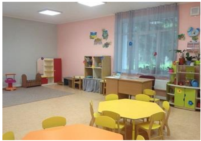
Boarding institution in Vovchansk, Kharkiv region: the building was completely renovated, energy saving measures were implemented