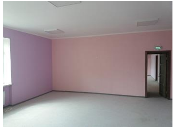
Kindergarten № 769, Kyiv: 75 additional places for children were created in 3 renovated group premises