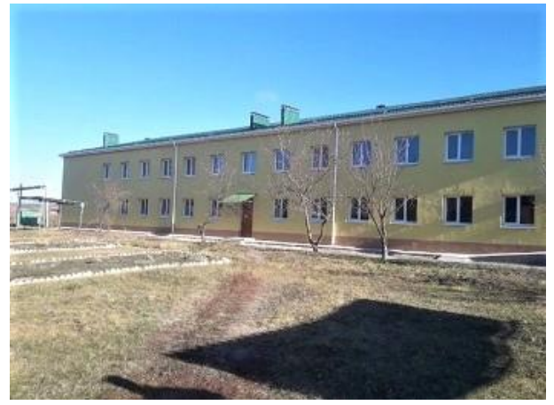
Preslav psychoneurological boarding institution, Zaporizhzhia region: the building was completely renovated, energy saving measures were implemented