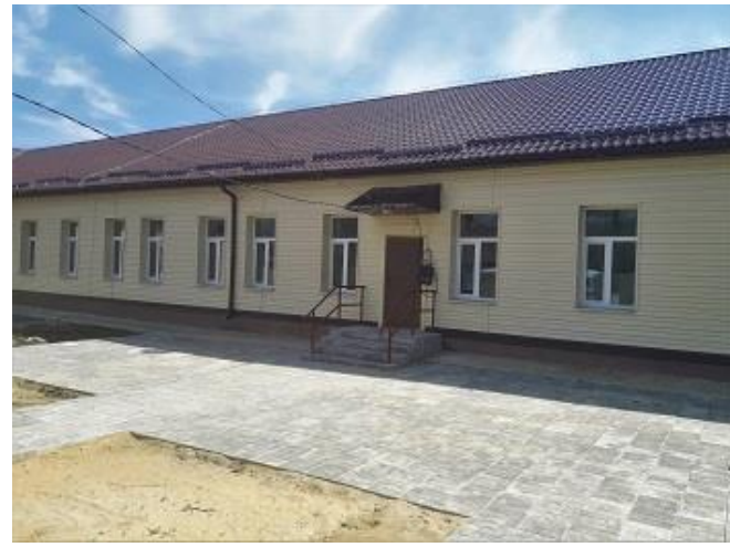
Apartment house in Pavlograd, Dnipropetrovsk region: the building with 19 apartments for accommodation of 40 IDPs was renovated